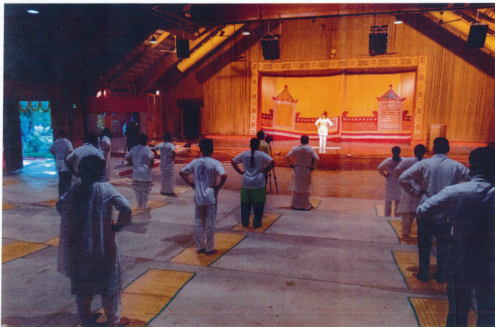
International Yoga Day – Common Yoga Protocol session