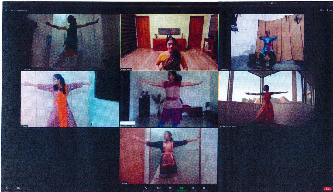
Saanganika Kaaryashaala 2021 – Online Bharatanatyam Workshop